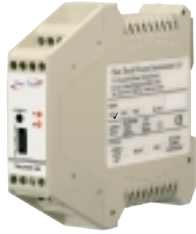
Data Acquisition and Signal Conditioner with Universal Input