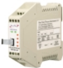
Logic Expansion Module