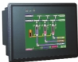
HMI Operator Interfaces